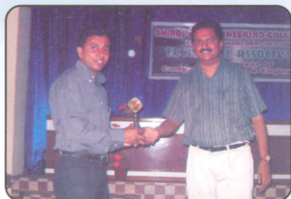
Computer Science Engineering