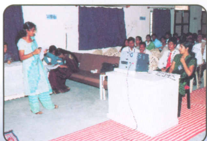
Electronic Communication Engineering