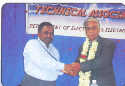
Electrical & Electronics Engineering

Painstaking efforts are being made by the Technical Associations of all the departments to organize guest lectures, seminars, workshops and project exhibition. This academic year many guest lectures, Technical seminars are conducted from the experts from various sectors of industry and institute.