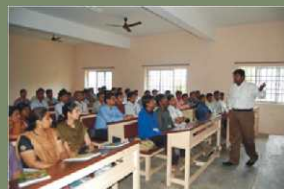
Placement training programme was conducted for Seventh Semester students for 6 days from 08.08.2011 to 13.08.2011.