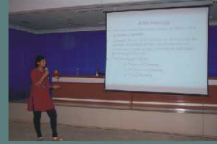
Students in Paper presentation