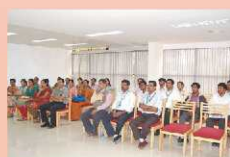
Faculty members at FANUC INDIA Pvt. Ltd, Electronic city Bangalore.