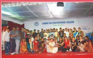
Department of Electrical & Electronics Engineering emerged as the overall champion in cultural events