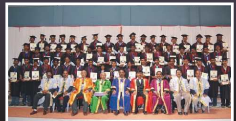
Mechanical Engineering Graduates