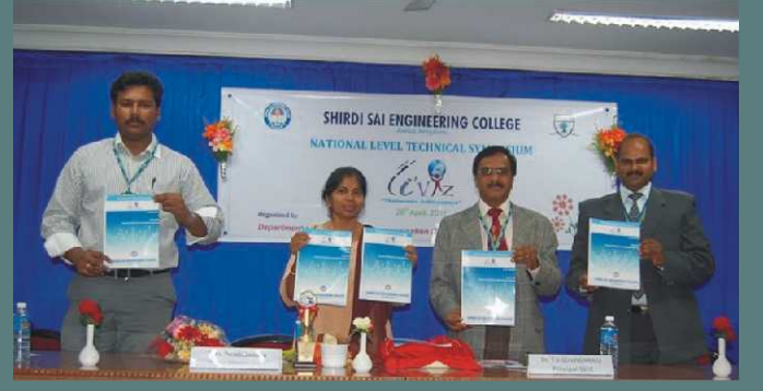
Releasing of proceedings of Li'vaz 2011

Various events such as paper presentation, Circuit debugging, Puzzles, Pick & speak, Technical quiz, Sherlock Holmes of electronics were conducted and totally 52 papers presented. There was an overwhelming response from various colleges across the country.