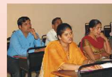
Faculty members attending the SDP very keenly.