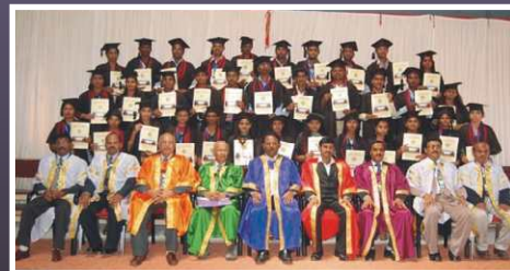
Electrical and Electronics Engineering Graduates