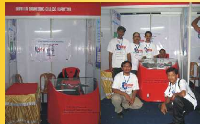
VELOMOBILE Displayed in Techno park with team members and Guide the project