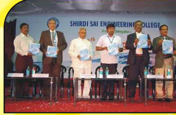
Dignitaries releasing our college souvenir SAI SPANDANA.