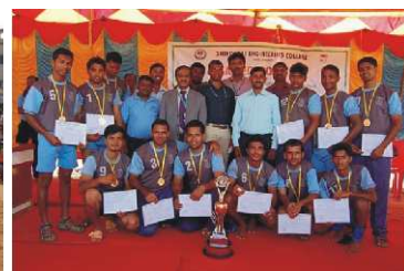
Sai Leo Trophy 2011 Champion VCET, Puttur.