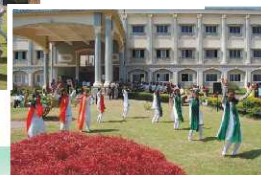
Students performing dance on Independence Day.