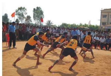
Our team playing against New Horizon college of Engineering