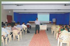
Placement aptitude training programme was conducted for our students on 19/04/2011