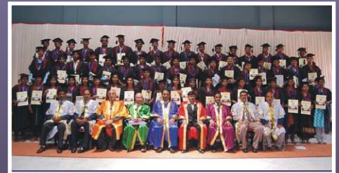
Electronics & Communication Engineering Graduates