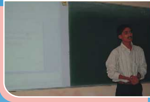
Student presenting the paper