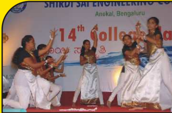
Mind-blowing performance by our students at college day