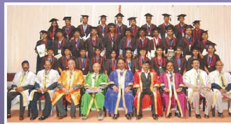
Computer Science Engineering Graduates