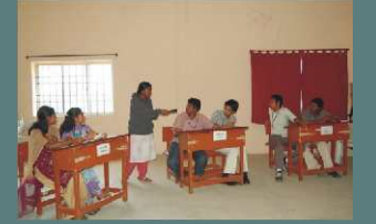
Students in Technical quiz