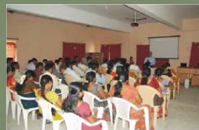
ISO Training programme was organized on 28/04/2011 for our faculty members