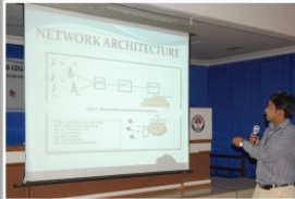
Student in Paper presentation