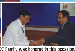
Our SSEC Family was honored in this occasion.