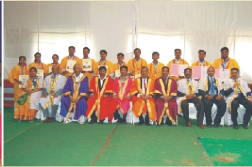
MASTER OF BUSINESS ADMINISTRATION GRADUATES