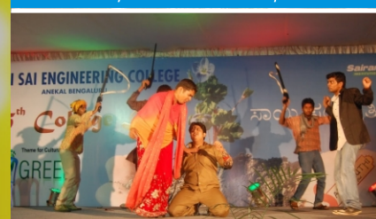
Our students performing the Skit on annual day