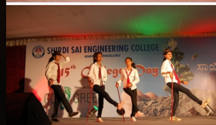
Colorful fusion dances performed by students