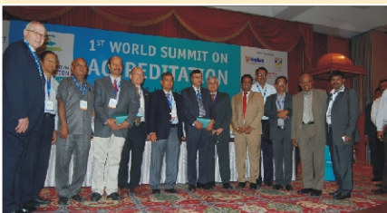
Dignitaries Group Photo Session at WOSA 2012