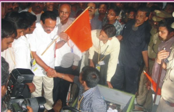
Chief Minister of Karnataka Sri.D.V.Sadananda Gowda congratulates our students for their innovative project