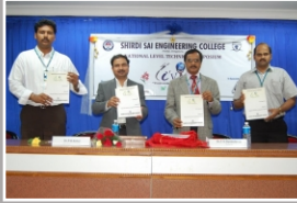
Releasing the proceedings of Li'vaz 2012 by Dignitaries