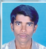
Paramesh III Sem 75 %