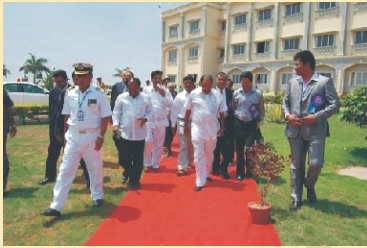
Dr. M. Veerappa Moily Union Minister of Corporate Affairs, Accepting the guard of honor during Graduation Day.