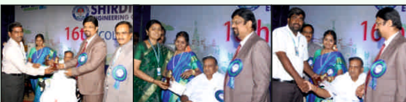
Faculty members getting appreciation and receiving trophies for their outstanding performance in academic work.