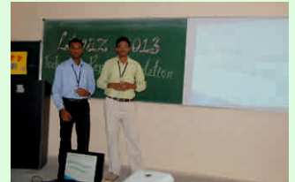
Students in Paper presentation