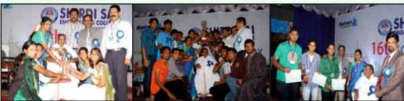
Our students receiving trophies and certificates from chairman and chief guest.