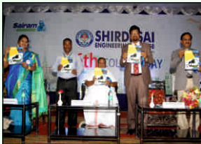
Our college Magazine "SAI SPANDANA" released on this college day.