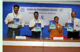
Releasing the proceedings of Li'vaz 2013 by Dignitaries