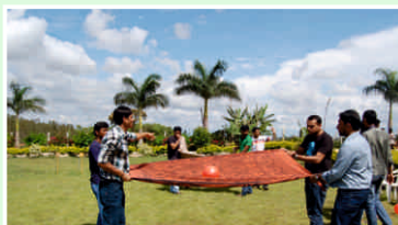
EVENTS ORGANISED FOR THE ALUMINI.