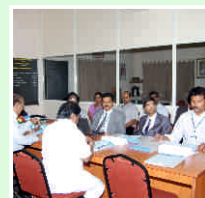
First advisory committee meeting on 11th November 2013