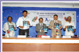
The Advaya Proceedings Released by the dignitaries