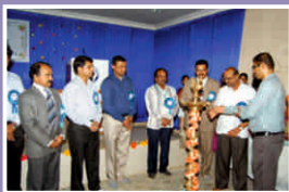
The Dignitaries lighting the lamp