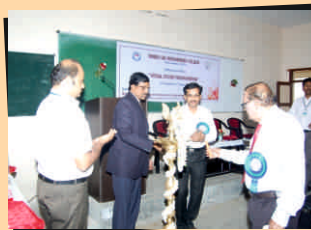
The dignitaries at the inaugural ceremony lighting the lamp. (FDP) organised by ECE Dept.