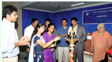
ALUMINI LIGHTING THE LAMP ON THE OCCASION OF ALUMINI MEET.

Our college is organizing Alumni meet ever since 2005. 8th Alumni meet was held on 15th September 2013(Sunday), at our institution. More than 60 alumni graced the occasion with their presence. It was a great opening to interact with our alumni to savor & revive their profound time spent collectively. It was an exceptional platform to invigorate, share knowledge and experiences, new thoughts and ideas with our fellow mates.