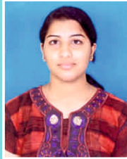
Sweytha kannan II Sem- 87.4%