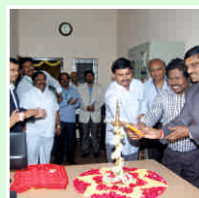
The dignitaries at the inaugural ceremony lighting the lamp.