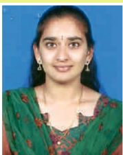
Kaipa Sandhya VIII sem - 85.60%