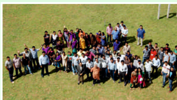
8TH ALUMINI MEET HELD AT SSEC ON 15TH