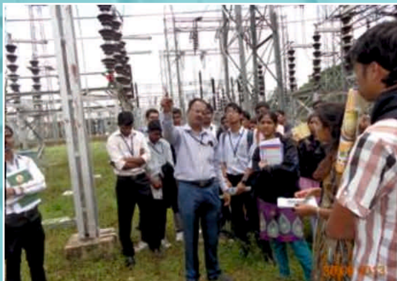
EEE IV & VI SEM students visited 220/66/11KV Receiving Substation, Sommanahalli, Bangalore on 30/09/2013.

ECE Department has also organised an industrial expedition for 5th semester section "A" on 8th October 2013 and for 5th semester section "B" on 11th september 2013 to Harita Seating Systems Ltd, Hosur.