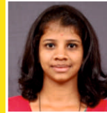
MANIKYA S I SEM- 74.70