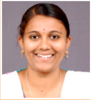
SPOORTHY S I sem - 82.50%