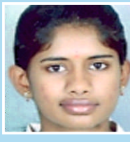
Raagapriya VII SEM-79.8%