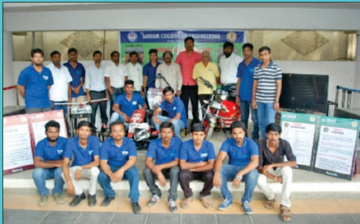
Students in the Mini Maker Fair 2016 at Bangalore.

The SSCE Students participated in the Bengaluru Mini Maker Fair 2016 on 23 October 2016, at Rangoli Metro Art Centre, Bengaluru. The Students Convention Centre project's article was published in the Ecoideaz.com - a collection of eco-friendly innovations and a showcase of all eco-friendly companies based in India.