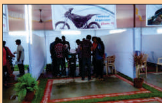
Technical Inspection of our Team Raiders