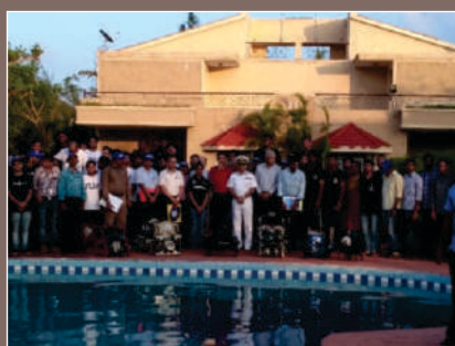
Team VARUNA in the NIOT SAVE 2016 Competition

SSCE Team VARUNA participated in national level Students Autonomous Underwater Vehicle challenge (SAVE 2016) organized by Nation Institute of Ocean Technology on 14th December 2016 and secured 5th Position in all over India.