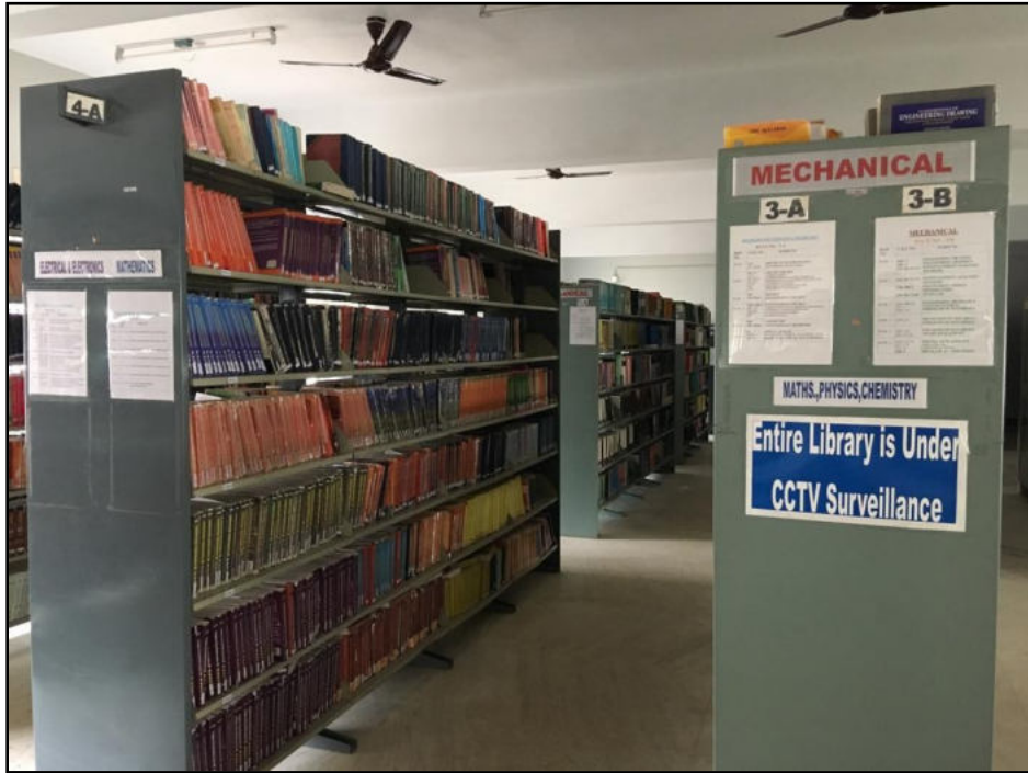
Library Rack Arrangements