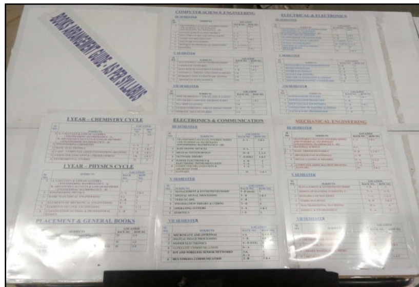
Display of Book Arrangement Guide

The guide will be revised every year, new subjects will be added as per the syllabus periodically.