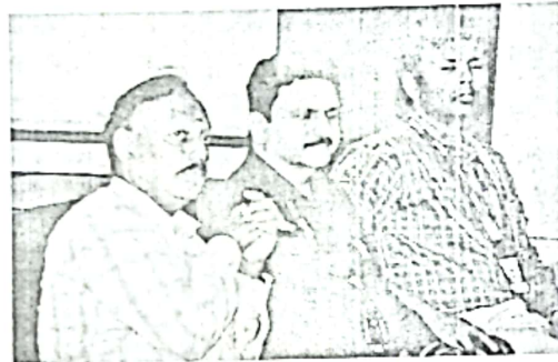
Feedback on Placement Awareness Program