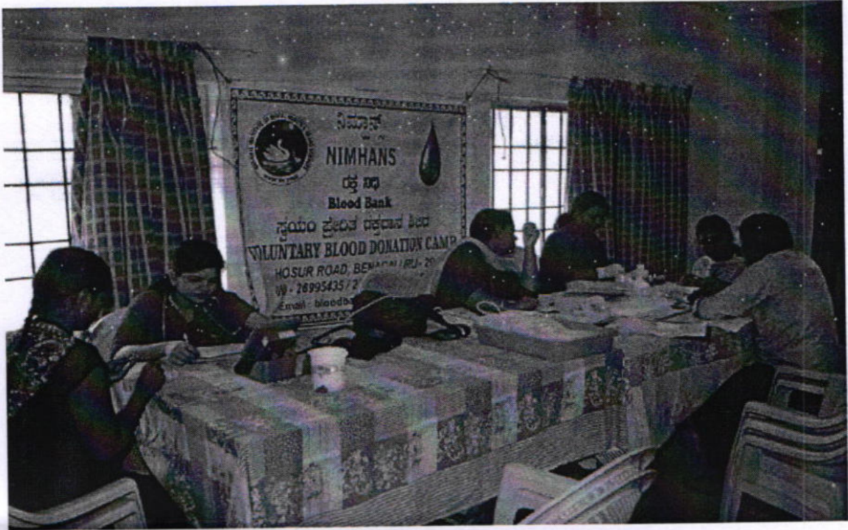
Blood Donation Camp organized by our institution to commemorate the birth anniversary of Dr.A.P.J Abdul Kalam Sir – held on 14 th October 2017.