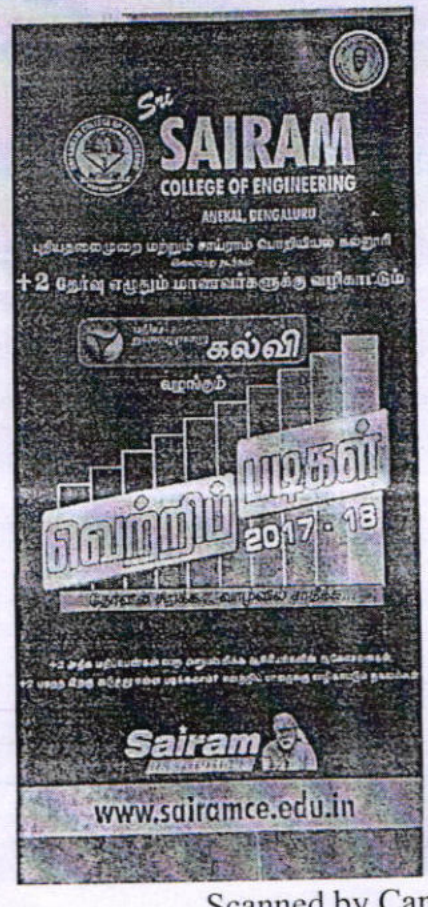
Scanned by CamScanner