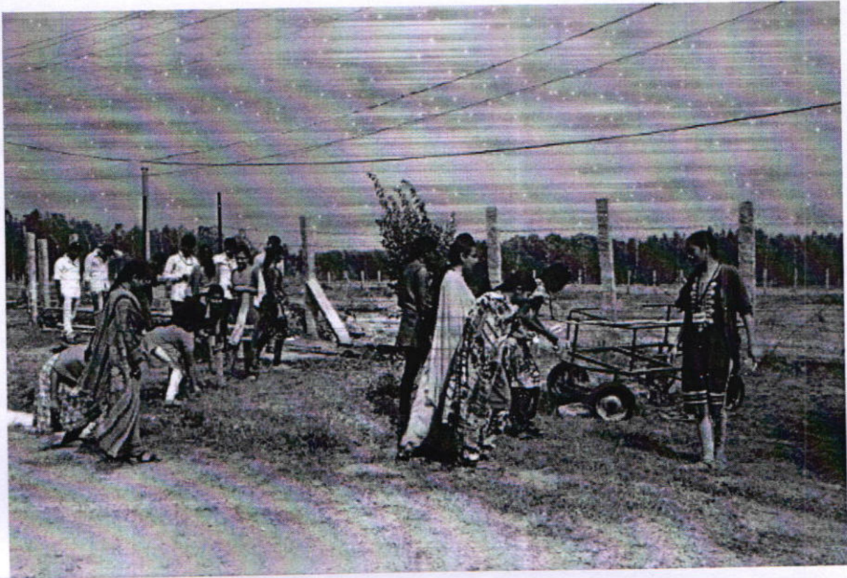
Swachh Bharat cleaning held on 9th Feb 2019