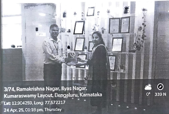
3/74, Ramakrishna Nagar, Ilyas Nagar, Kumaraswamy Layout, Bengaluru, Karnataka Lat: 12.904259, Long: 77.572217 24 Apr, 25, 01:18 pm, Thursday