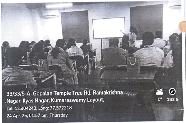
33/33/5-A, Gopalan Temple Tree Rd, Ramakrishna Nagar, Ilyas Nagar, Kumaraswamy Layout, Lat: 12.904243, Long: 77.572218 24 Apr, 25, 01:57 pm, Thursday