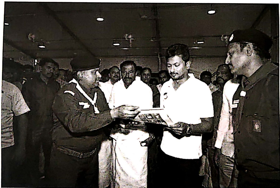
CEO Sir explaining to the Honourable Deputy Chief Minister Thiru Udhayanidhi Stalin