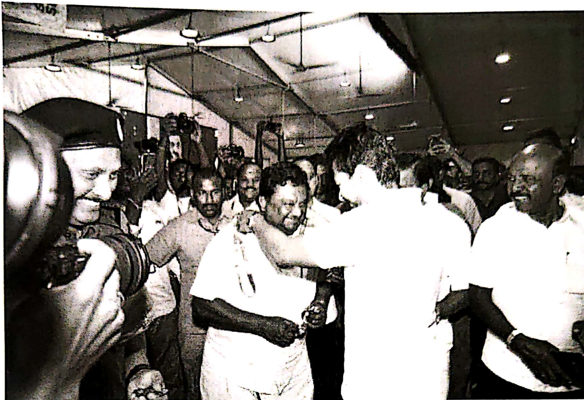
Thiru S.S.Sivasankar Honourable Minister for Transport and Electricity