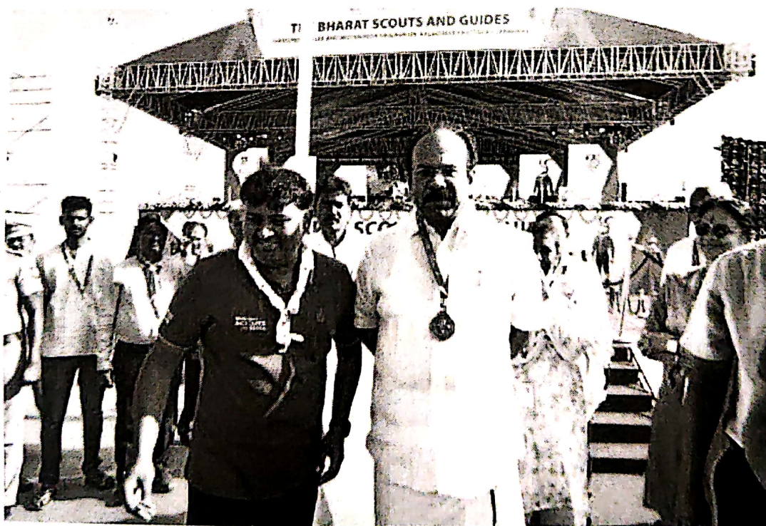
CEO Sir with Thiru Thangam Thennarasu Honourable Minister for Finance and Environment Climate Change