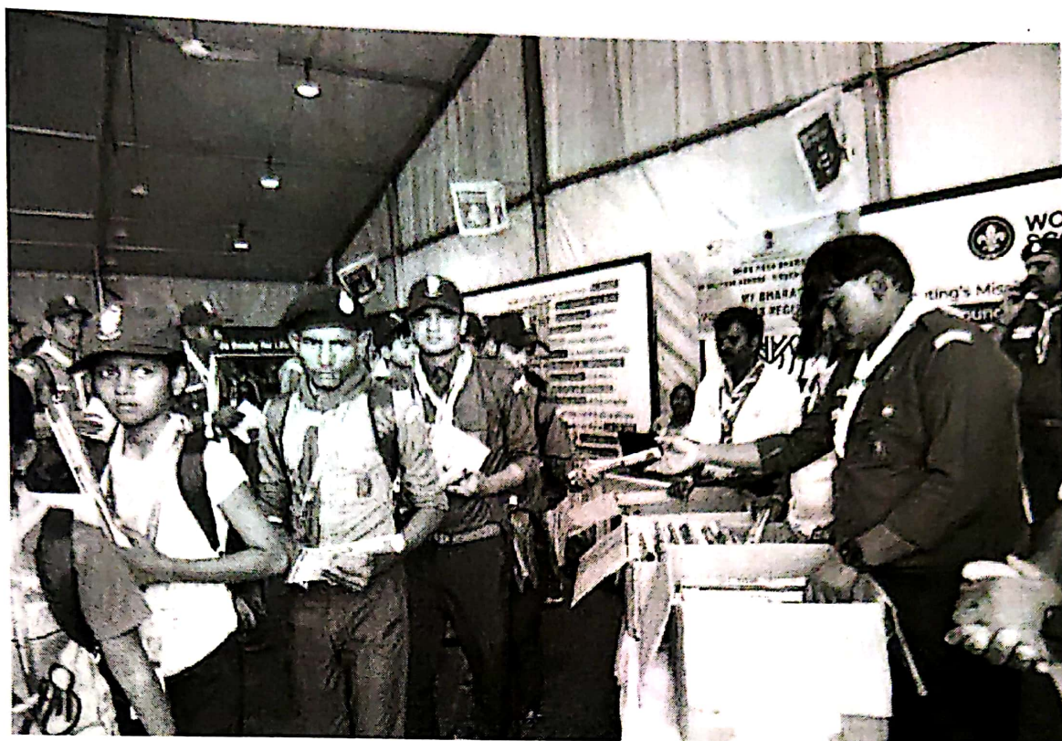
Our CEO Sir distributing calendars for all the participants at the Jamboree Event