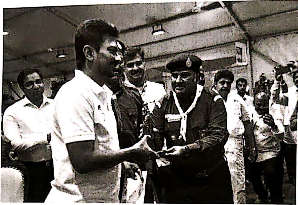
Our CEO Sir welcoming Honourable Deputy Chief Minister Thiru Udhayanidhi Stalin