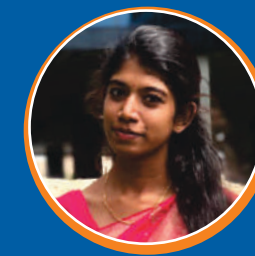
PRIYANKA CSE Netcracker

visit www.sairamce.edu.in to view the complete list