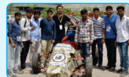
Our SAE SUPRA Formula 1 vehicle team at Buddh International circuit