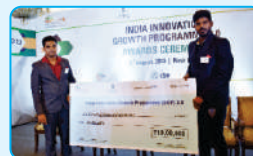
Our student winners of IIGP 2.0 with prize money Rs. 10 lakhs