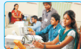
Advanced Research & Innovation Centers