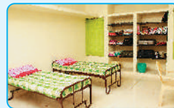
Hostel Facilities for Boys & Girls