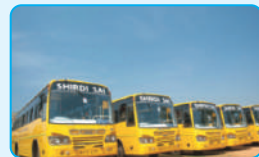
College Bus Services